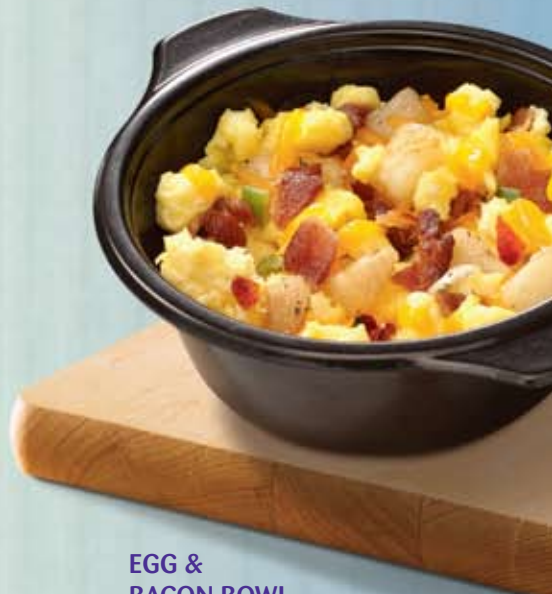
EGG & BACON BOWL 5.5 oz. (#89266)

These easy-to-carry bowls come in either bacon or sausage varieties. Each also contains eggs, potato, Cheddar cheese, red and green peppers, and diced onions.