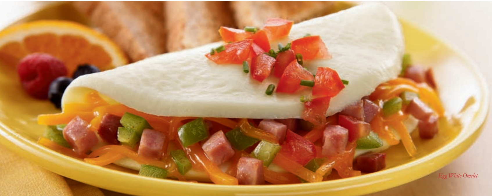
Egg White Omelet